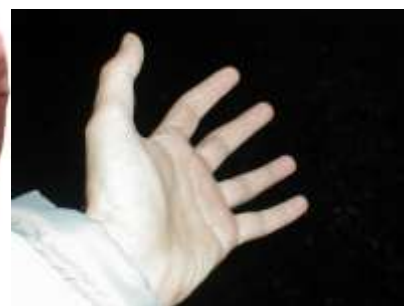
Constantly wanting more