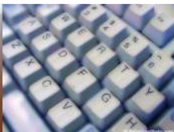
Workaholicism and RSI