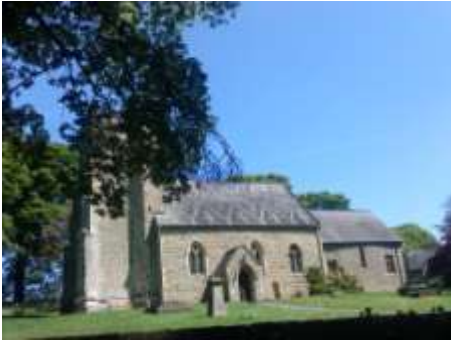
© 2010 Liz Baddaley @ the Sanctuary