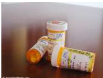
Drug and alcohol addiction

Equipment needed: Print outs of the images below, the relevant single word or phrase label for each one, and the sign you create using the 'For display' text below.