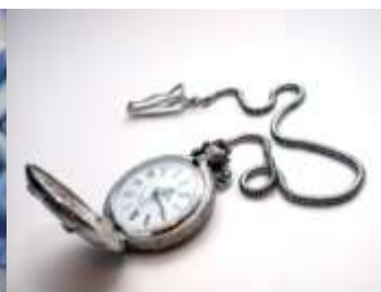
Busyness and stress