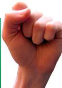
Violence and abuse