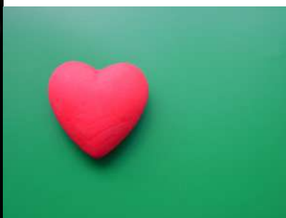
Obsession with relationships